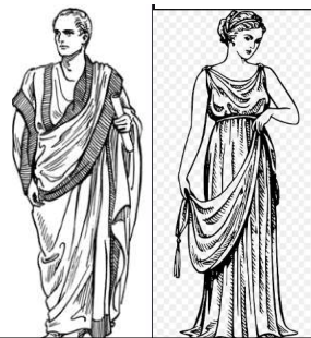
Ancient Greek Clothing