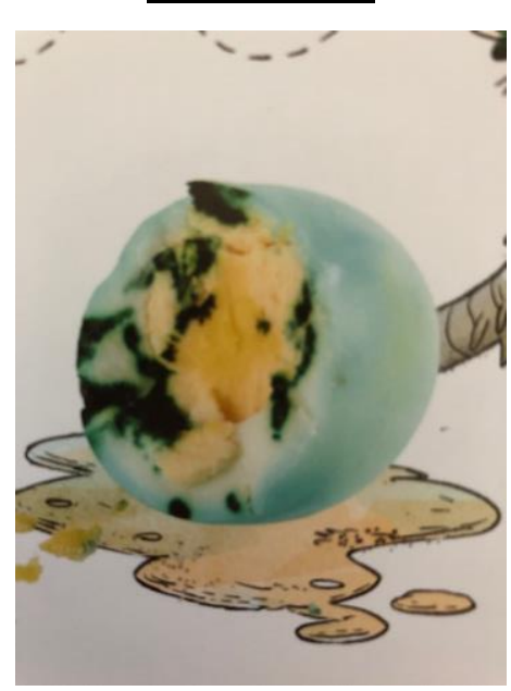
Ingredients – 1 Method - D