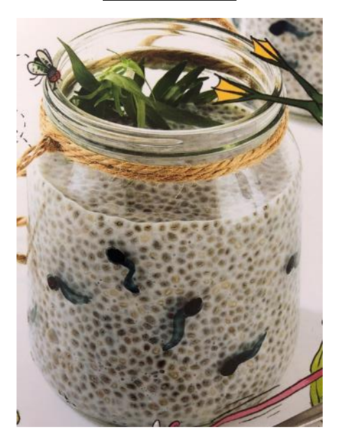
Ingredients – 4 Method - B