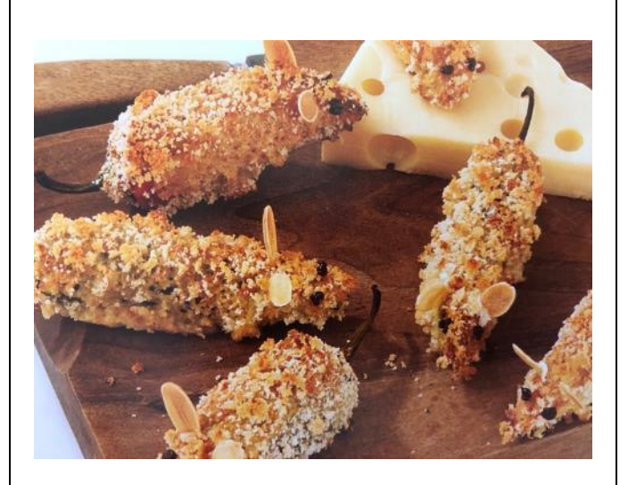
Ingredients – 2 Method - C