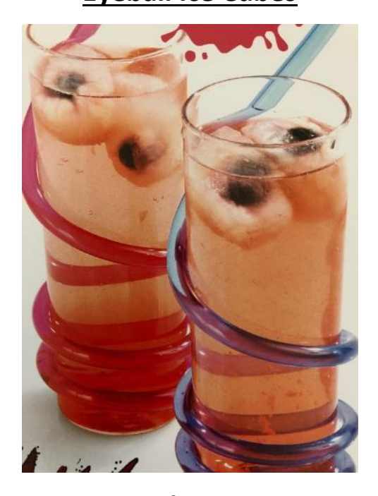
Ingredients – 3 Method - A